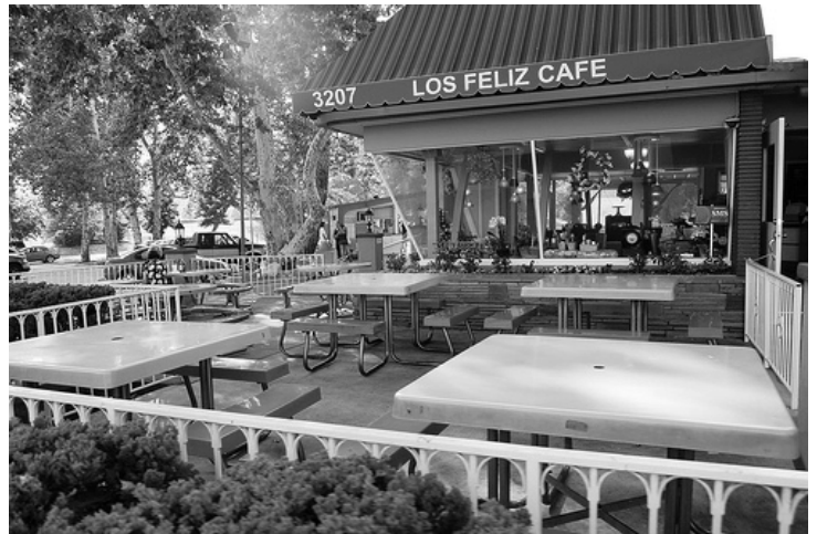
An Oldie but a Goodie... at 3207 Los Feliz Blvd. next to the Par 3 Los Feliz Municipal Golf Course where The Goonies will be screened July 17th!