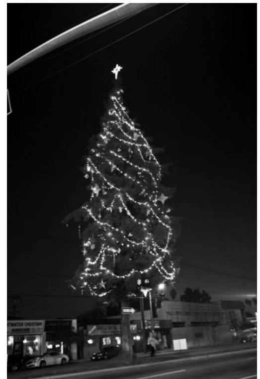
Glendale Blvd. Thursday, December 4, 2008. Dusk.

And by everyone's estimation, this year's spectacular tree lighting ceremony was done right.