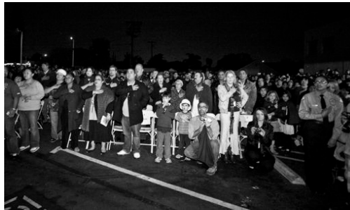
The crowd is lead in the Pledge of Allegiance by the LAPD Northeast Division Explorer Color Guard