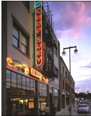
SurveyLA will be seeking public input to identify sites of historic significance to local communities, including historic community anchors such as Little Tokyo's Far East Building.

including students and local community members, who can contribute information to the project that will help shape these future survey assessments.